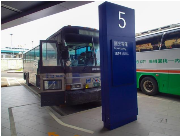
Look for bus 1819, pay 125NT at counter 7