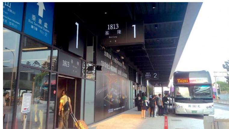
Look for bus 1813, pay 55NT at counter inside the building