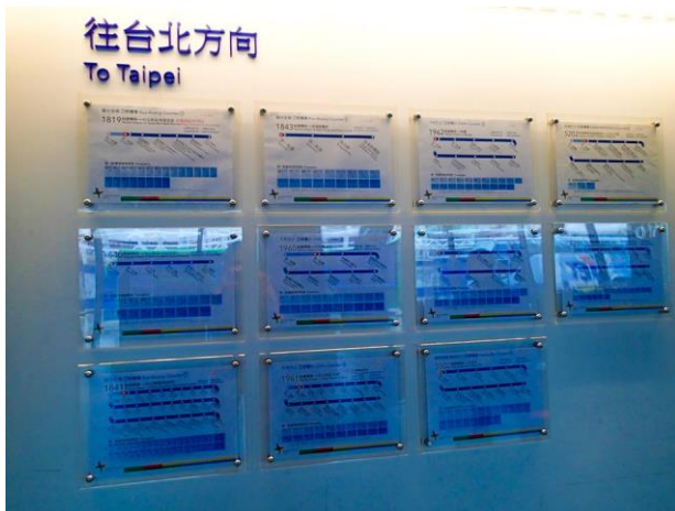
At the bus station you will see this