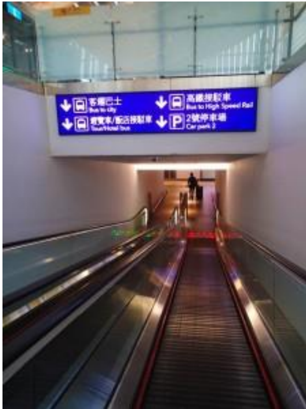
Follow the signs "Bus to city"

Bus from the airport to Taipei Main Station: