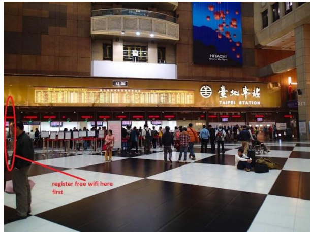
Optional: register for free Wi-Fi at TMS

Bus from the Taipei Main Station to Keelung: