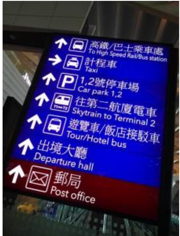
To bus station, to the basemen